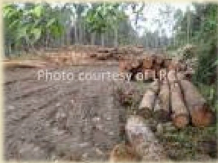
Gingoog City, Misamis Oriental