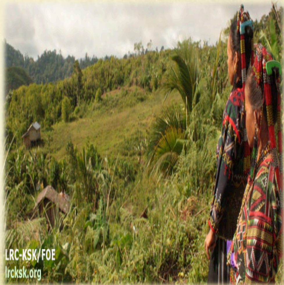
Lake Sebu, South Cotabato